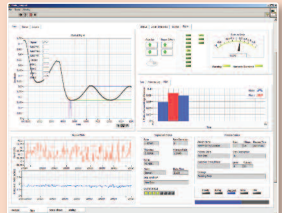
Spectrum-Pro Optical Monitor Screen